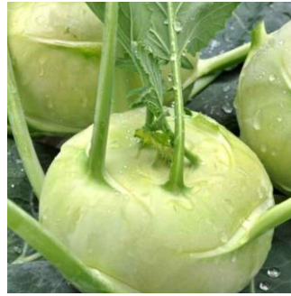
White Vienna Kohlrabi