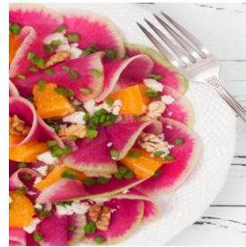
Watermelon Radish, Orange & Goat Cheese Salad